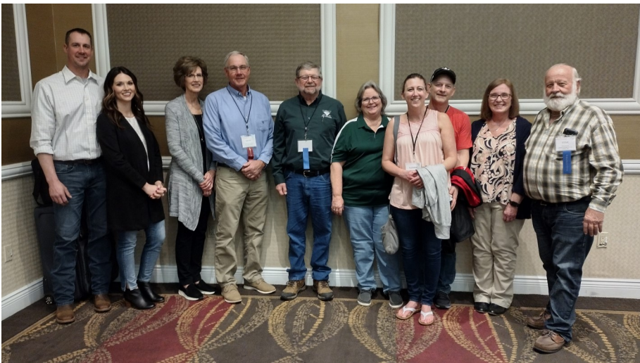
OLICA MEMBERS IN ATTENDANCE AT THE CATERPILLAR AWARDS BANQUET