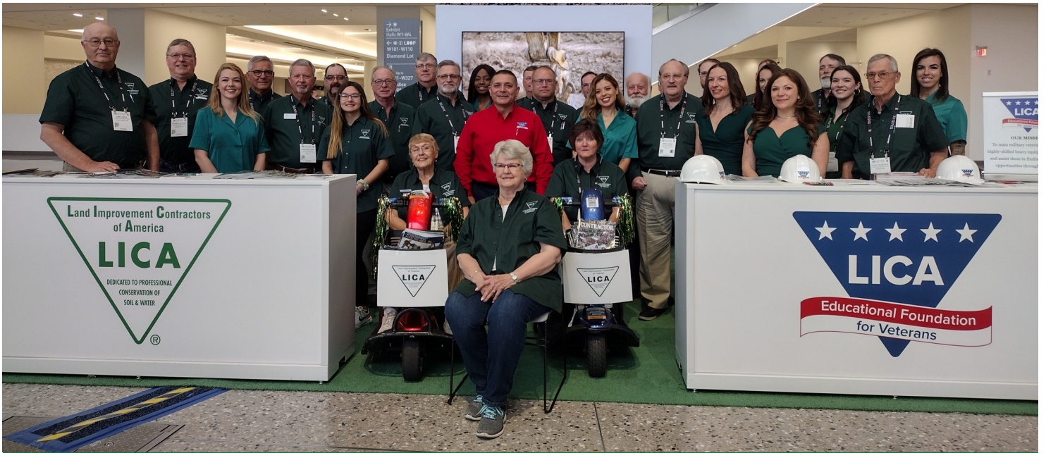
LICA MEMBERS AND STAFF POSE FOR A PICTURE AT THE LICA BOOTH BEFORE THE START OF CONEXPO 2023